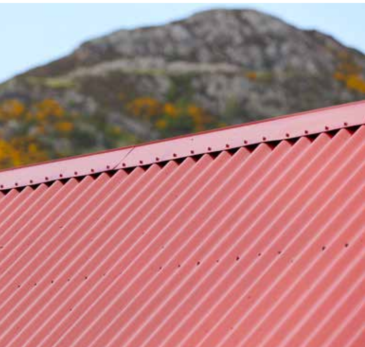
PHOTOS FERNAIG COTTAGE: AI REY SPACES, ARCHITECTURAL PHOTOGRAPHY; COPYRIGHT: SSAB

PROJECT: WESTER ROSS, SCOTLAND, UK »FERNAIG COTTAGE«