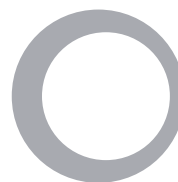
Cross section of a cold drawn tube with variations in wall thickness